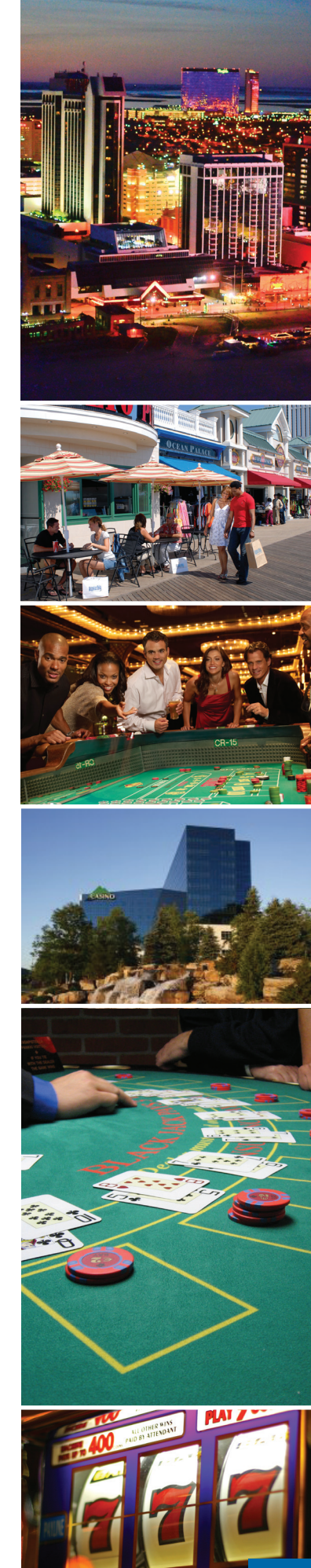
Casino bonuses are offered at the discretion of the casino and are subject to change without notice.